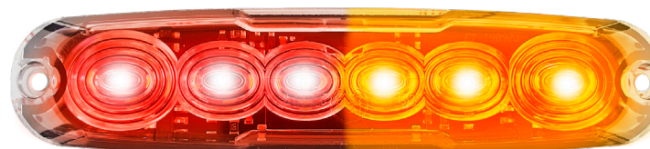
P/N 12ARM-2 - Twin Blister