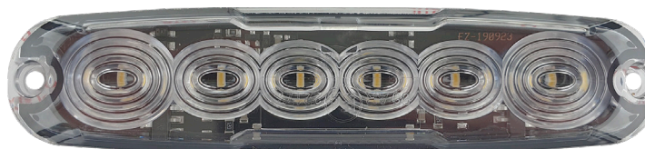
Clear Lens when Inactive